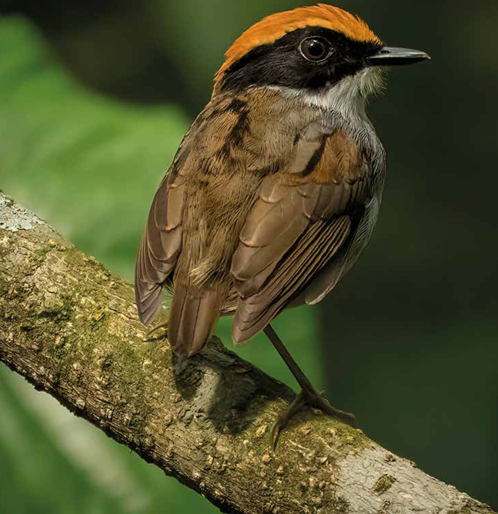
Black-cheeked Gnatcatcher © Santiago Salazar