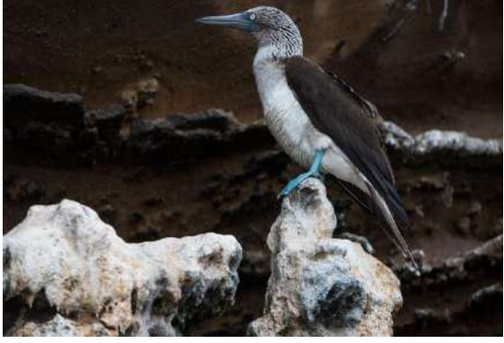
SATURDAY, FERNANDINA AND ISABELA AM: PUNTA ESPINOZA, Fernandina Island PM: URBINA BAY, Isabela Island