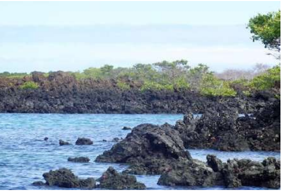
MONDAY, FLOREANA AM: POST OFFICE BAY PM: CHAMPION