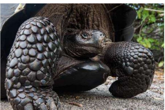
SUNDAY, ISABELA AM: ELIZABETH BAY PM: PUNTA MORENO